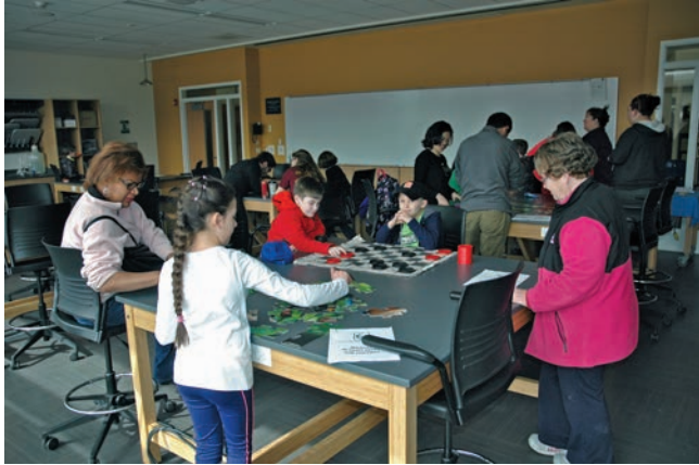
Children's nature room is full of activity (M. Holy)