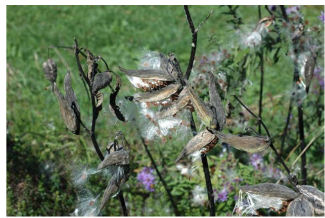
Opening milkweed pods