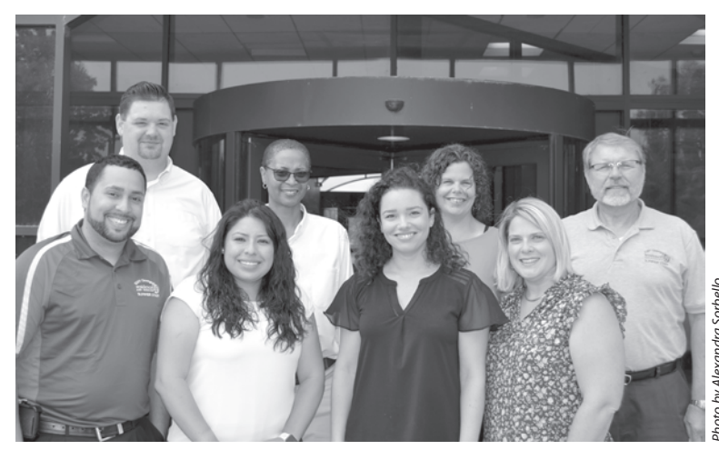
Residence Life and Housing management staff.

Faculty Resident Mentors (FRMs) are liaisons between faculty and students who encourage the intellectual stimulation and academic success of students living in Hart Hall. The FRMs live in apartments in the Hart Global Living and Learning Center and work closely with the residence hall staff in developing the academic community and meeting the needs of students.