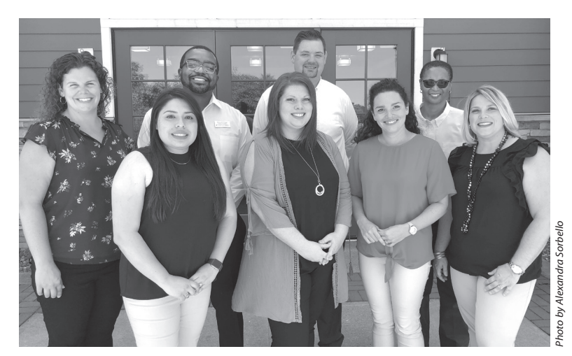
Residence Life and Housing management staff.

Faculty Resident Mentors (FRMs) are liaisons between faculty and students who encourage the intellectual stimulation and academic success of students living in Hart Hall. The FRMs live in apartments in the Hart Global Living and Learning Center and work closely with the residence hall staff in developing the academic community and meeting the needs of students.