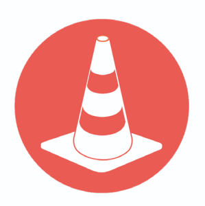
Trades, Safety, and Risk Management