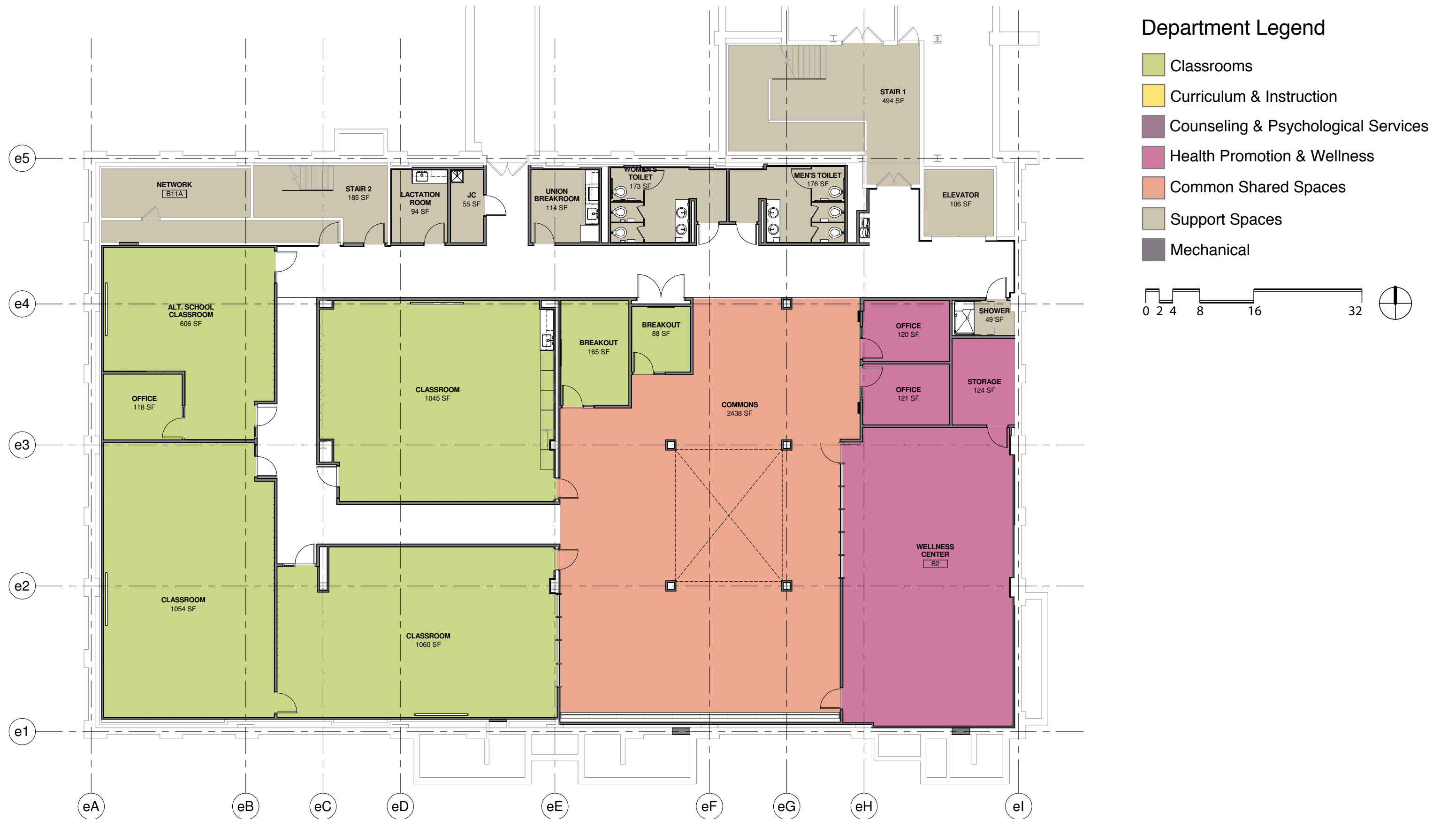
Basement Plan - Alternate Scope