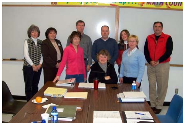
Mid-State North 2006 SDP Team

All the SDP teams are off and running. Weekly meetings, issue analyses, topic sessions, and superintendent interviews are helping them explore this important leadership role. On July 12 th and 13 th all the associates and faculty will again convene in Liverpool for the mid-program session. A busy agenda is being planned as we write!