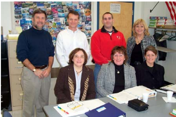
Central New York 2006 SDP Team