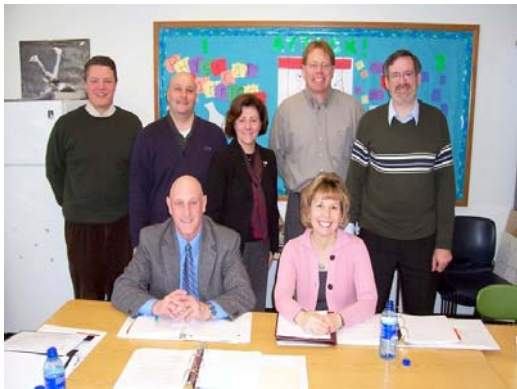
Western New York-North 2006 SDP Team