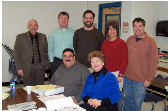
Mid-State South 2006 SDP Team