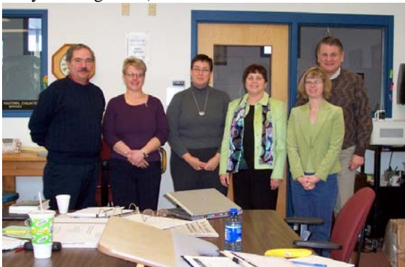
Hudson-Mohawk Region 2006 SDP Team

Seven teams of associates have been formed regionally. The teams are Western New York (Buffalo to Jamestown), Mid-West (mostly in the Rochester area), Mid-State North (primarily Onondaga and Oswego counties), Mid-State South (Cayuga and Tompkins counties), Central New York (the Mohawk Valley), Southern Tier (centered around Corning and Hammondsport), and Hudson-Mohawk (the greater Albany-Saratoga area).