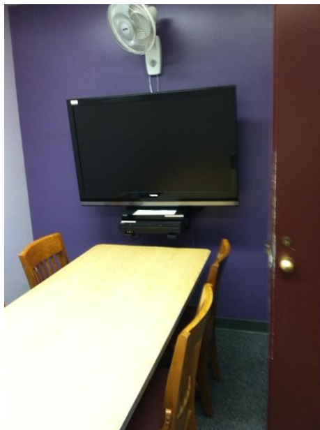
Technology equipped meeting space — room 211

Penfield Library recognizes the ever increasing need for Group Study space. We anticipate additional rooms when the building is renovated in the coming years. For now, we have created new spaces on the second floor. Adjacent to the Teaching Resource Center we are using shelving and books to create two spaces with a "room" like feel. Both spaces include a table with electrical outlets and seating for four. We have also repurposed room 211 near the second floor desk for group collaboration and presentation practice. — Tom Larson