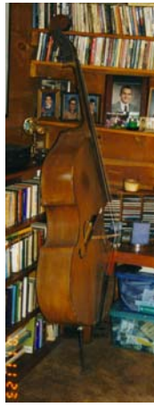
Warming up my trombone before a November 2006 Oswego College Concert Band performance; my double bass; on my bike-2004.